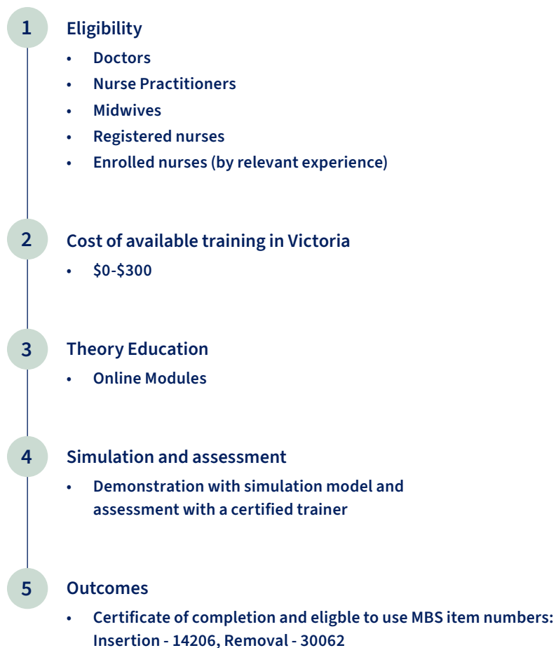
Figure 2: Steps of contraceptive implant (Implanon NXT) training

It's important you are covered with your medical indemnity company.